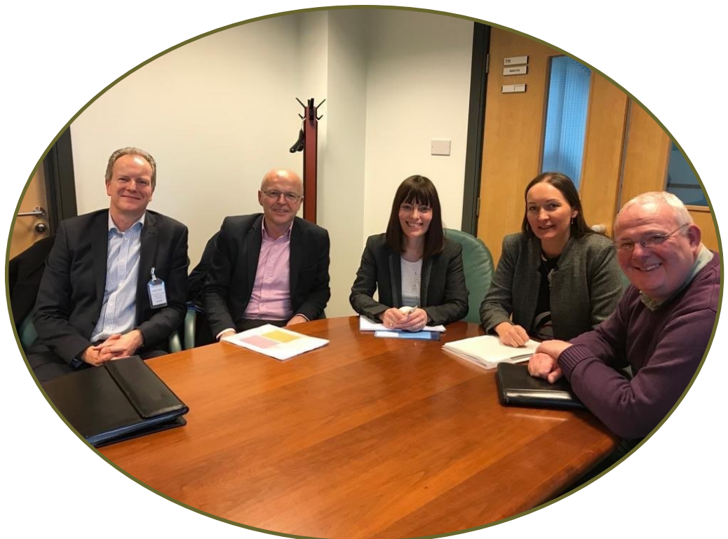
Board and staff members meet with Minister for Infrastructure, Nichola Mallon MLA

A few groups were also keen to input to and influence the Draft Local Development Plans which are currently being prepared by local councils – issues groups wanted brought to the fore in the Plans include: social and affordable housing; sustainable transport; improved health and wellbeing and ensuring communities are balanced and protected from over-development. We also continued to provide support to a number of groups who are opposing major and significant planning applications including a proposal for a gold mining extraction plant in Co Tyrone (soon to be the subject of a Public Inquiry); and two large-scale renewable energy proposals (one in Kells, Co Antrim and another in The Sperrins).