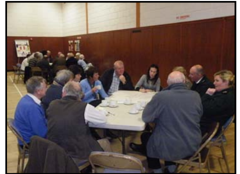
Community Meeting - November 2009