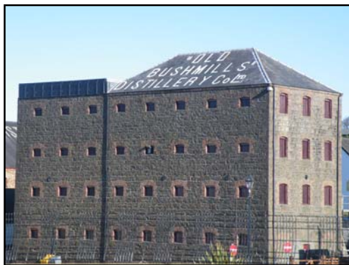
Old Bushmills Distillery

A number of organisations will be responsible for delivering on these key areas of work. They include Bushmills Village Forum, Moyle District Council and local businesses.