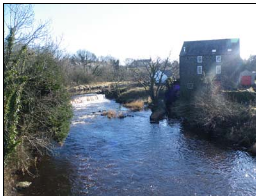
River Bush at Currie's Mill