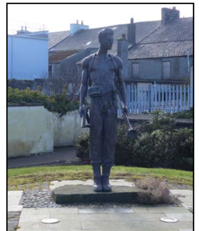
Alphabet Angel - Dundarave