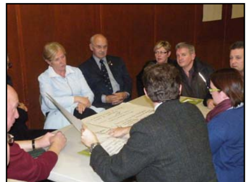
Community Meeting - November 2009

The production of this Local Community Plan marks an important milestone in the Community Planning process for Bushmills. However, the real benefit of this process to local residents will be the implementation of the actions outlined in the plan to address those needs identified through the community meeting.