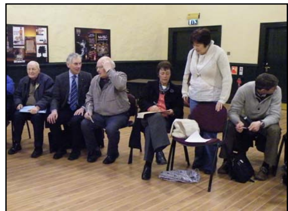
Community Planning Workshop - February 2010