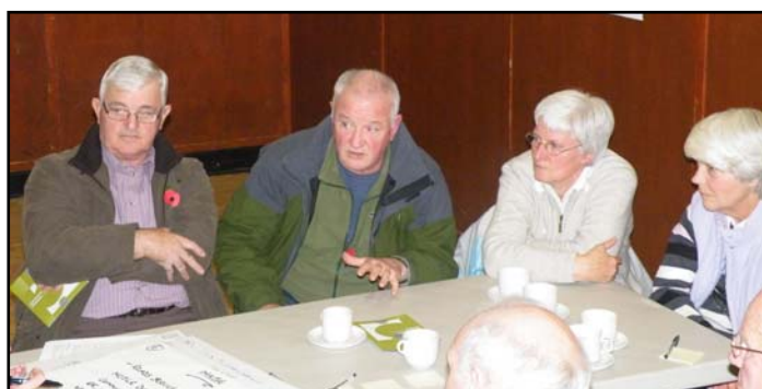
Community Meeting - November 2009