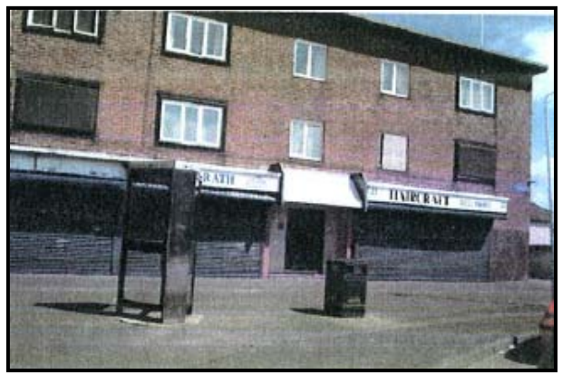
Decline in services in the Scrabo Estate

In recent years the Estate has lost many local services including the local post office, greengrocers, newsagents and hairdressers together with recreational spaces.