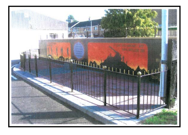
Completed Mural Project

A Re-imaging Project proposal was developed with assistance from the Council's Good Relations Officer and supported by the Arts Council. The aim of the initiative was to improve the local environment and create a more welcoming community for all.