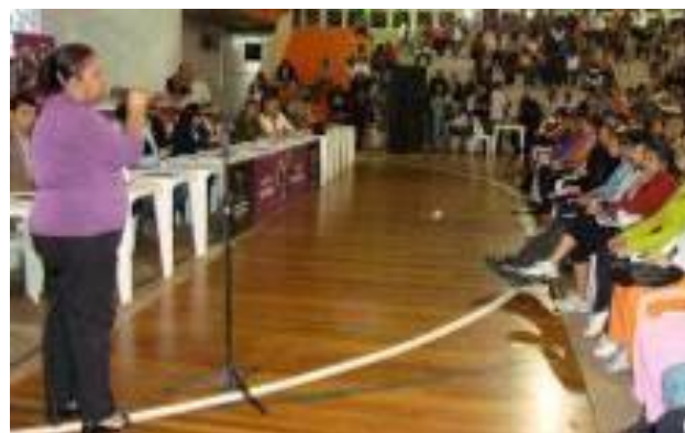
Participatory Budgeting Assembly in Porto Alegre

Deliberation can and should be built into any stage of your public engagement.