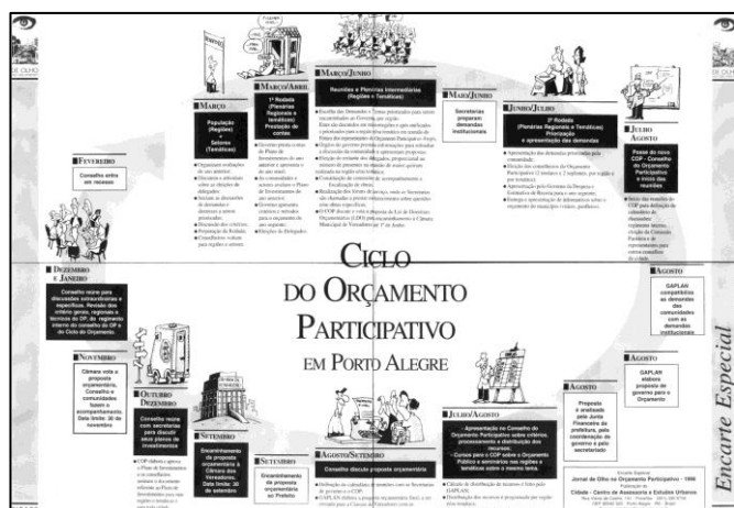
The annual cycle of PB in Porto Alegre in the year 2000

The third institutional factor essential to how PB developed in Porto Alegre was the annual cycle, which was widely publicised, and it explained to citizens when, where and how they could participate.