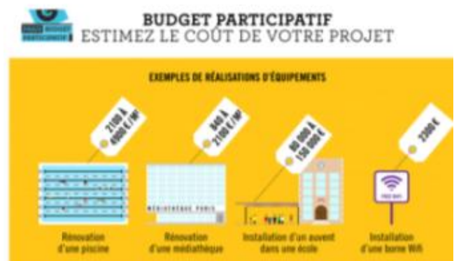
Info-graphic from Paris's PB programme

Paris uses online technology to receive, develop and prioritise project ideas coming directly from citizens.