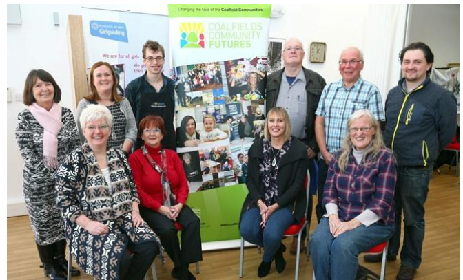
The Woodburn Coalfields Community Futures Steering Group, courtesy of the CRT website.