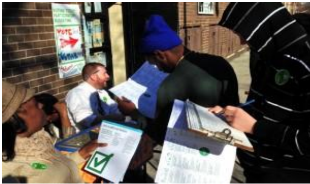
Volunteer PB community organisers go out canvassing on the street in New York

In 2016 with over 51,000 voters casting ballots to allocate a total of $32 million dollars to projects across the city, New York's experiment in direct democracy quickly became the largest of its kind in North America.