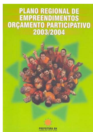
Cover of the rulebook regulating PB in the Brazilian city of Belo Horizonte in 2003/4

Within the rules were also laid out how elected members engaged with the process. Primarily their role was to provide essential oversight, not to control or decide on behalf of the citizens assembly, which validates the work of the COP and GAPLAN.